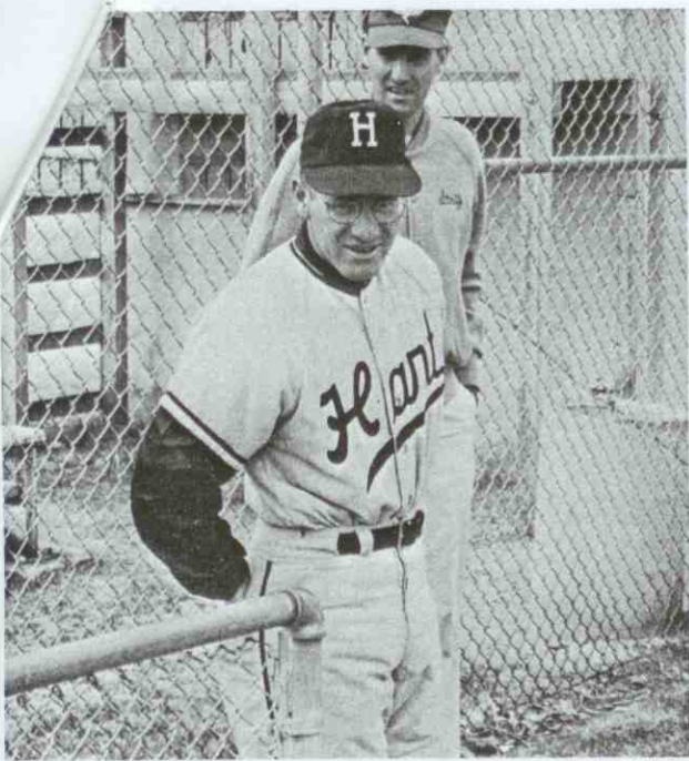
Sweating it out on the sideline.